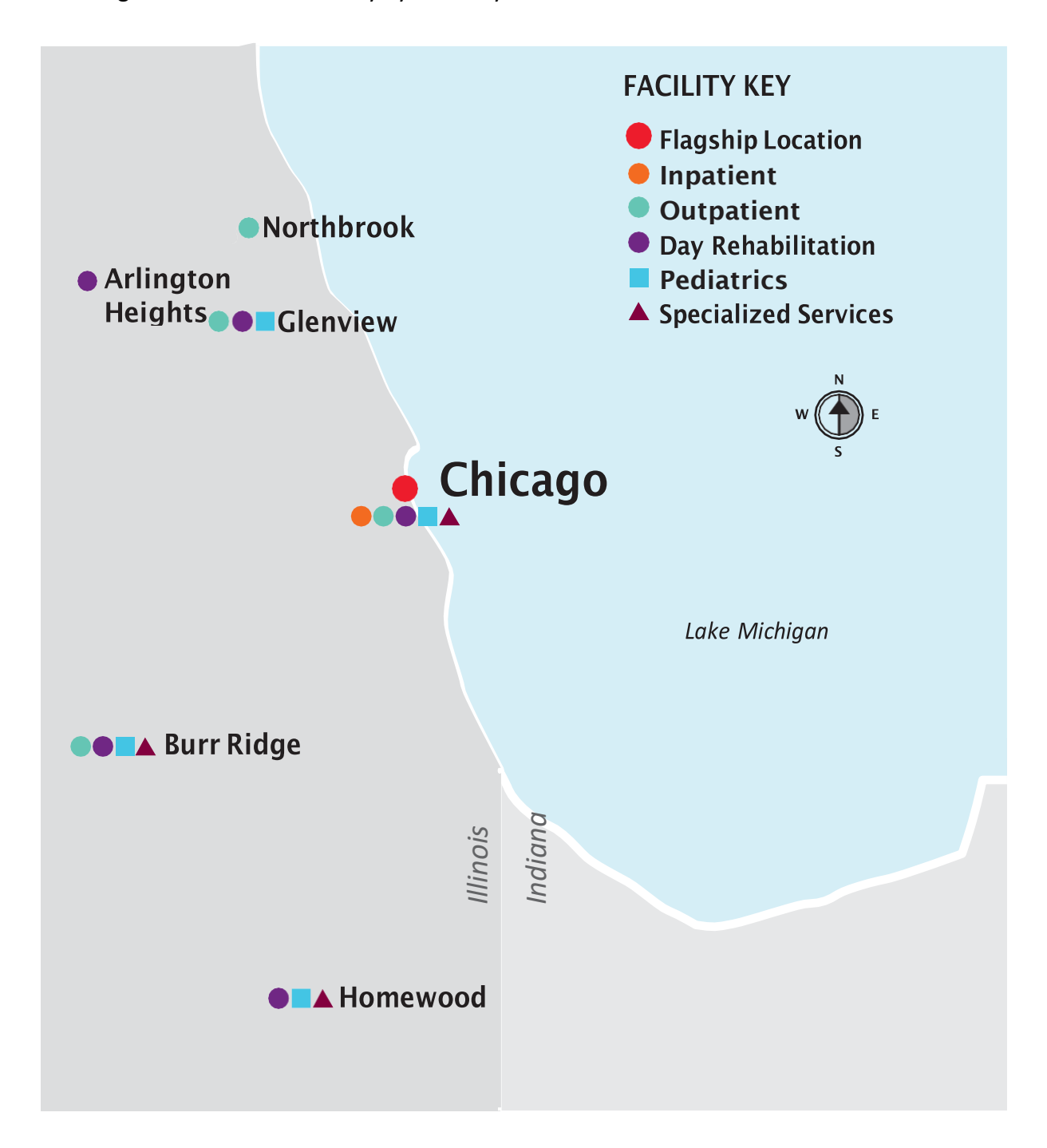
Figure \, 1. \, Shirley \, Ryan \, Ability Lab \, sites \, of \, care, \, including \, its \, wholly \, owned \, sites \,

The following is an overview of Shirley Ryan AbilityLab locations: