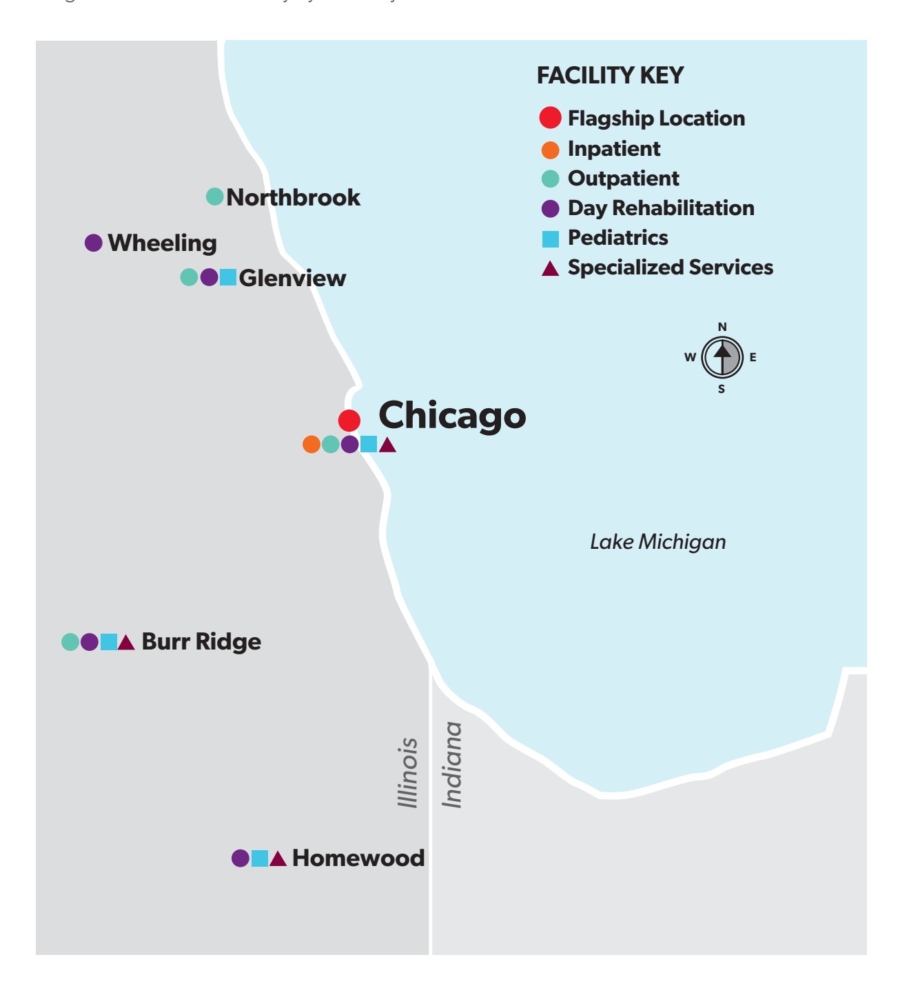
Figure 1. Shirley Ryan AbilityLab sites of care, including its wholly owned sites.

Following is an overview of Shirley Ryan AbilityLab locations: